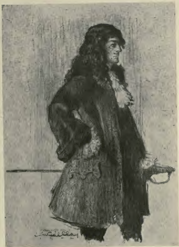
MANSFIELD AS MONSIEUR BEUCAIRE From a Drawing by John Cecil Clay